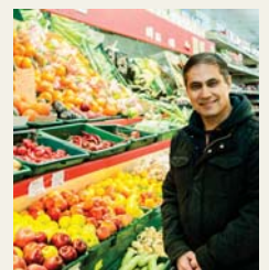
Harrow Council | Page 11