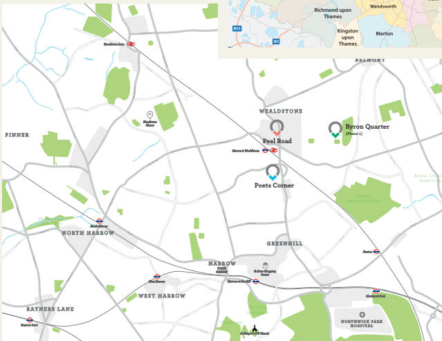
Page 10 | Harrow Council

spaces, its connectivity by rail and Tube to central London and the diversity of its people.